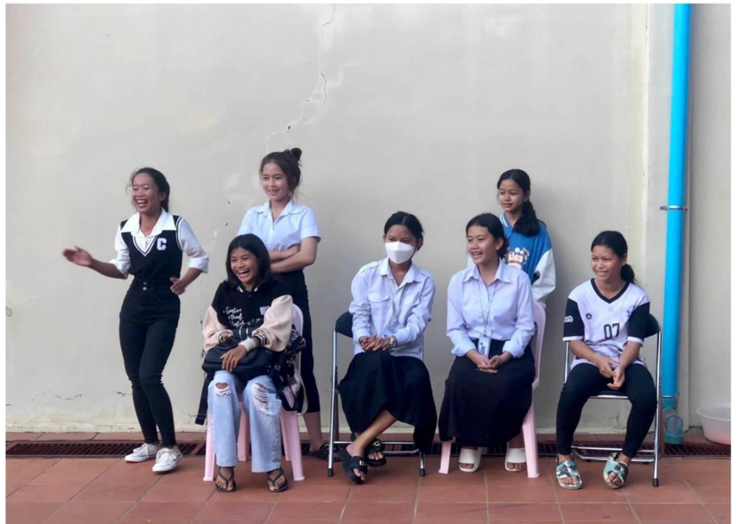
Smiles All Around