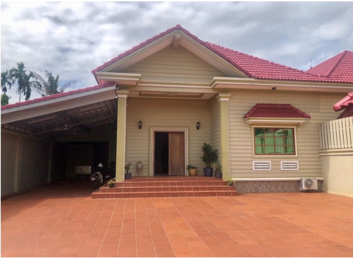
Our New Location