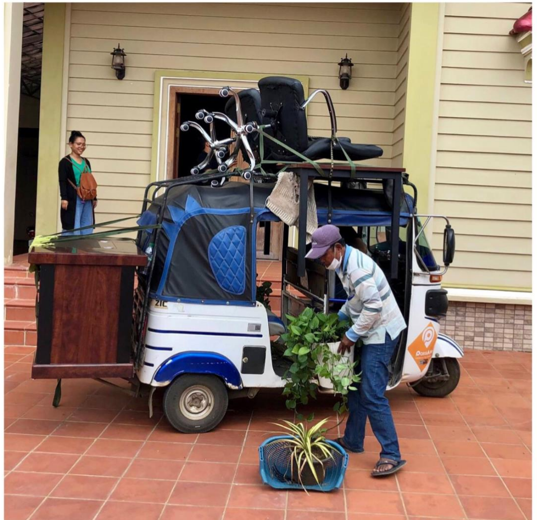
Moving Cambodia Style