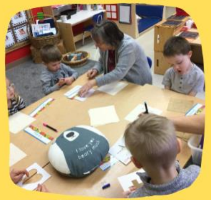
SEWING QUILT SQUARES WITH SHILOH SEWING LADIES